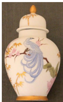
Oriental Jar with Peacock