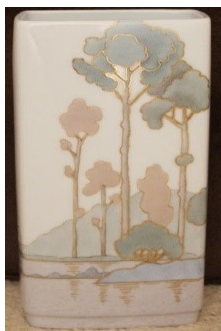
Modern Tree with Lustre