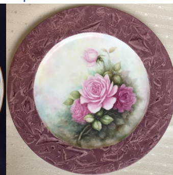
Right: "9in. Rose Plate"