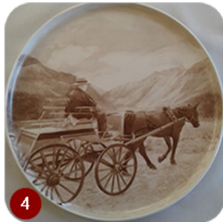
Photo 1.) Christine Handley "Bone" (Passed) Photo 2.) Glenys Muntz "Bone" (Passed) Photo 3.) Glenys Muntz "Lustre" (Passed) Photo 4.) Glenys Muntz "Monochromatic" (Passed)

Achievement is not small or big. Achievement is truly great! Well done.