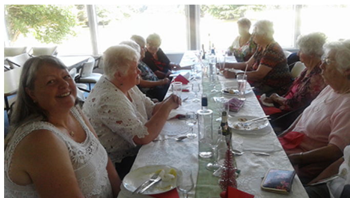
Photo: Group photo after a delicious lunch

May this Christmas be a fitting ending to a successful year for you. As you celebrate the glory of this wonderful season, may your home be filled with love, peace, and joy. May these blessings follow you throughout the New Year. Wishing you safe travels this holiday season and always from our family to yours.