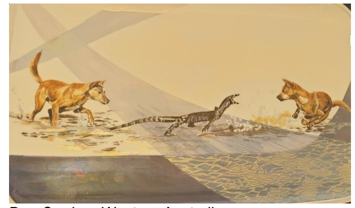
Dee Credaro Western Australia