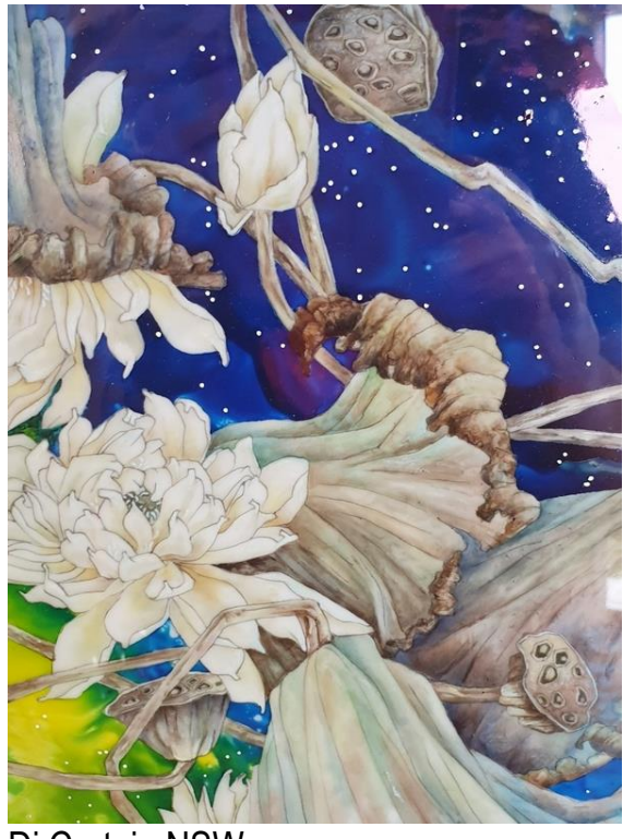
Di Curtain NSW