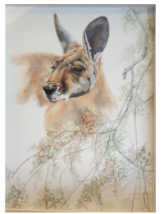
Kangaroo by the billabong by Di Curtain