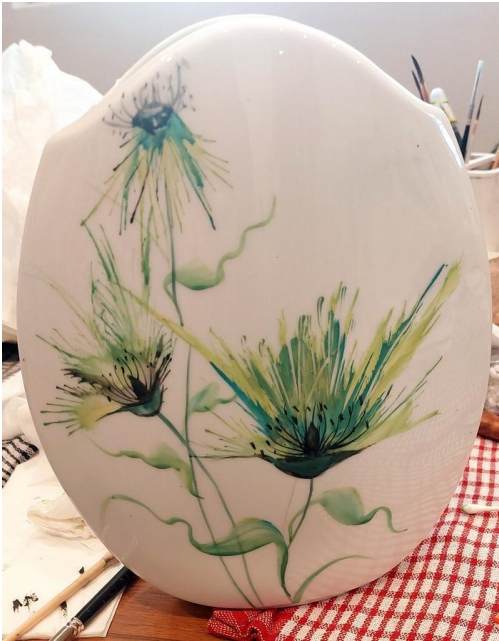
Painted at the Sydney Class by a student.