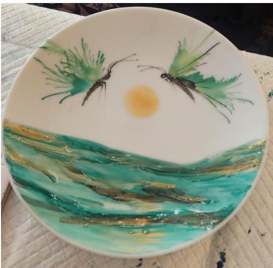
Painting by Clothilde at the Sydney class

The following piece is painted by Estrella Munoz who mixed her colours for the gems with water based medium and dried with a hair dryer. Once dry she then mixed the same colours with oil mixing medium then painted using normal painting medium directly over the water-based paint then Fired at 800. Great idea.